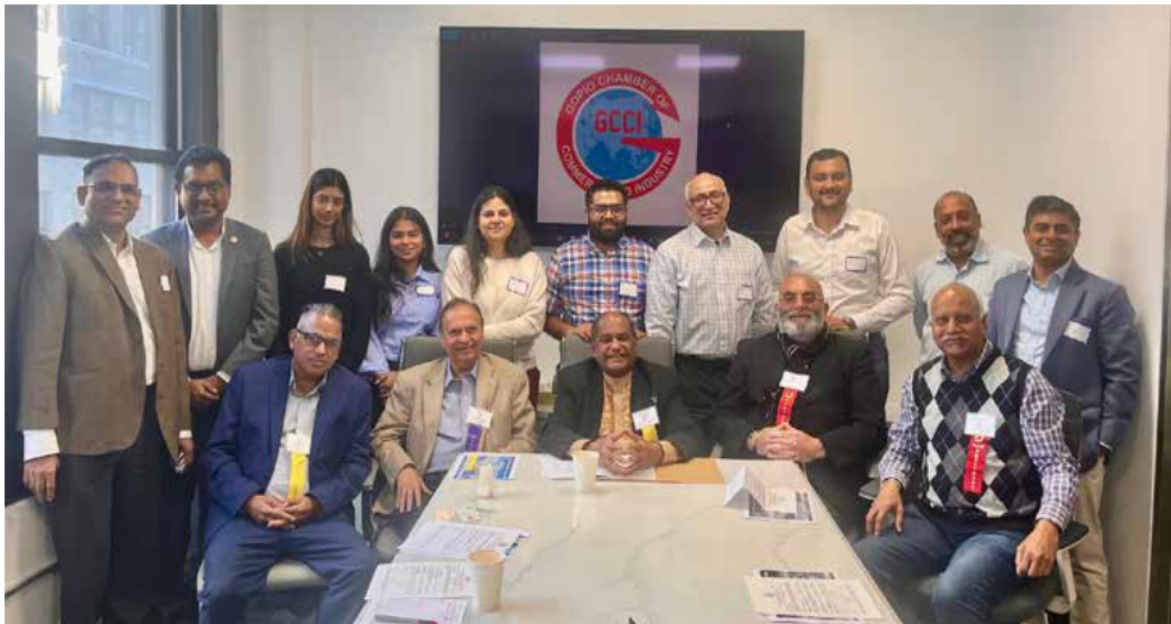
GCCI New York Mtg. Group Photo